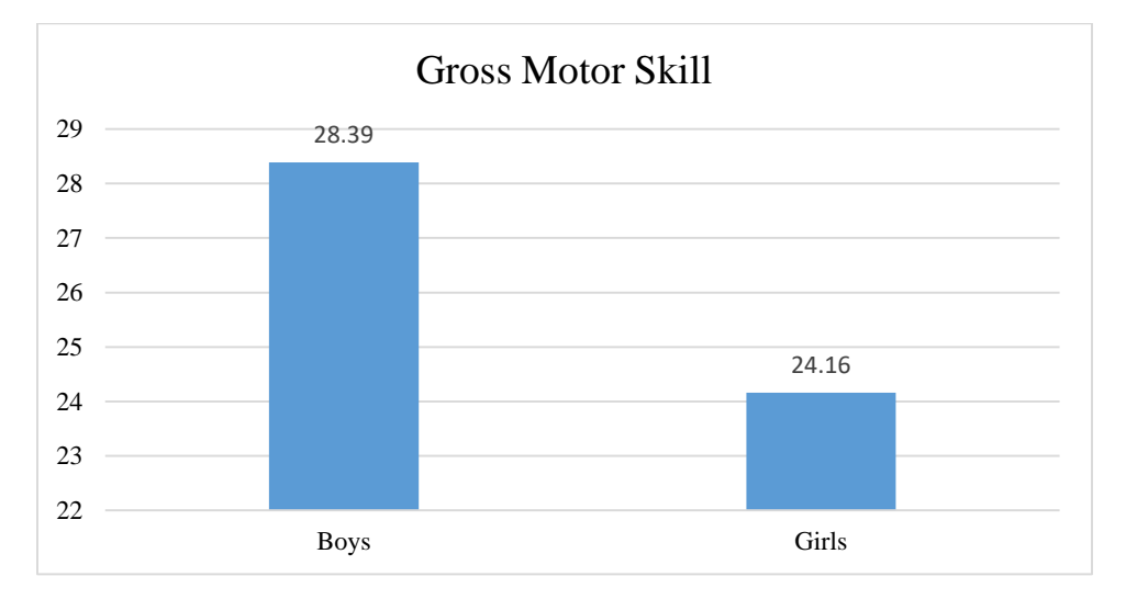
Figure 3. Mean of gross motor skill across genders